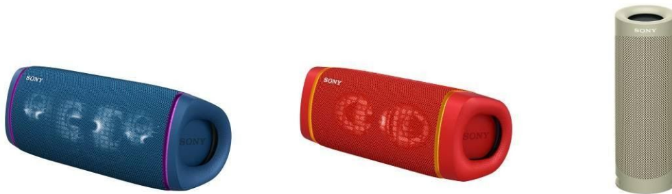
SRS-XB43, SRS-XB33 and SRS-XB23