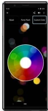
“Fiestable” companion app

You can even control the speaker from the dancefloor with the “Sony | Music Centre” app 6 . You can select your favourite playlist, cue the next song or turn the lighting off to suit your mood.